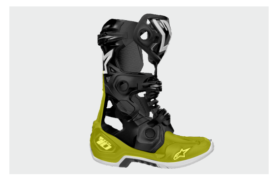
5 DENSITIES INJECTED SINGLE PIECE SHELL

CONTROLLED FLEXIBILITY SUPPORT AND IMPACT PROTECTION