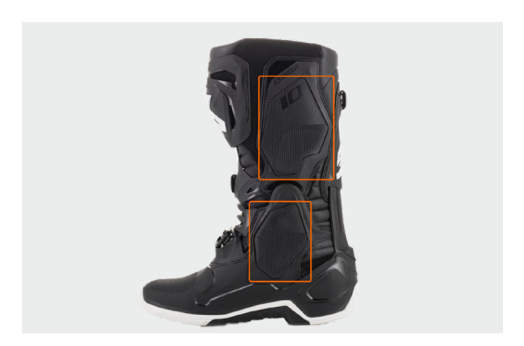
3D MEDIAL GRIP ZONE

COLD FORGING TECHNOLOGY SELF ALIGNING, EASY TO OPERATE, DURABLE