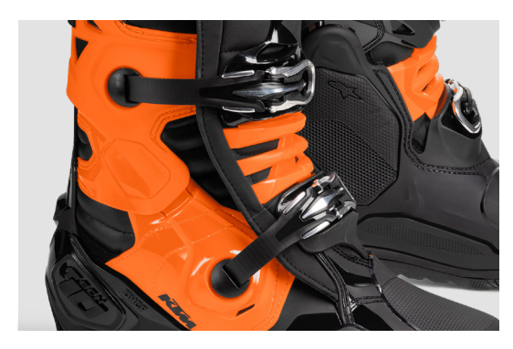
DOUBLE PIVOT MOTION CONTROL

INTEGRATED PATENTED COLLAPSABLE SHOCK ABSORBER FOR HIGH IMPACTS