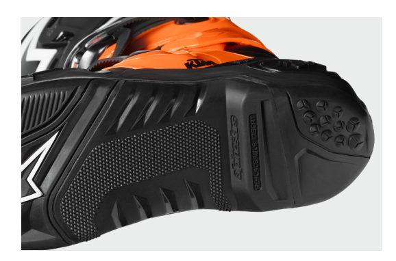
DYNAMIC HEEL COMPRESSION PROTECTOR

CONTROLLED FLEXIBILITY SUPPORT AND IMPACT PROTECTION MEDIAL AND BACK PANEL