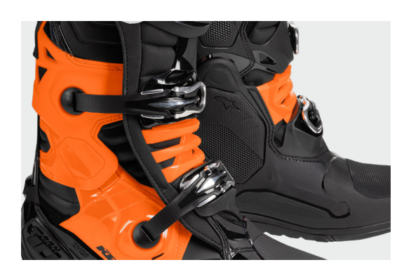
PREMIUM BUCKLE SYSTEM

FRONT FLEXION CONTROL IMPACT PROTECTION PRECISE FIT