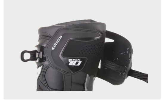
FLOATING SHIN PLATE

FRONT FLEXION CONTROL DUAL BLADE SYSTEM DOUBLE DENSITY FLEXION FORCE ABSORBTION FRAME