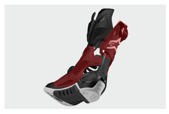
5 DENSITIES INJECTED SINGLE PIECE PANEL

CONTROLLED FLEXIBILITY SUPPORT AND IMPACT PROTECTION