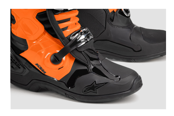
LOW PROFILE TOE BOX GREATER FEELING OF CONTROLS